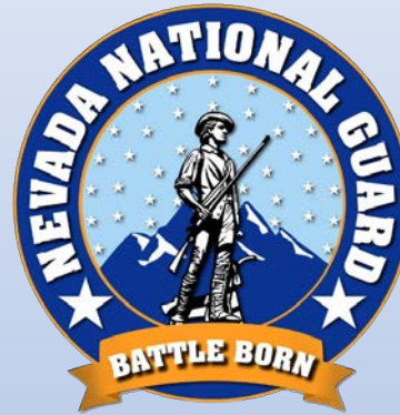
Nevada Air National Guard